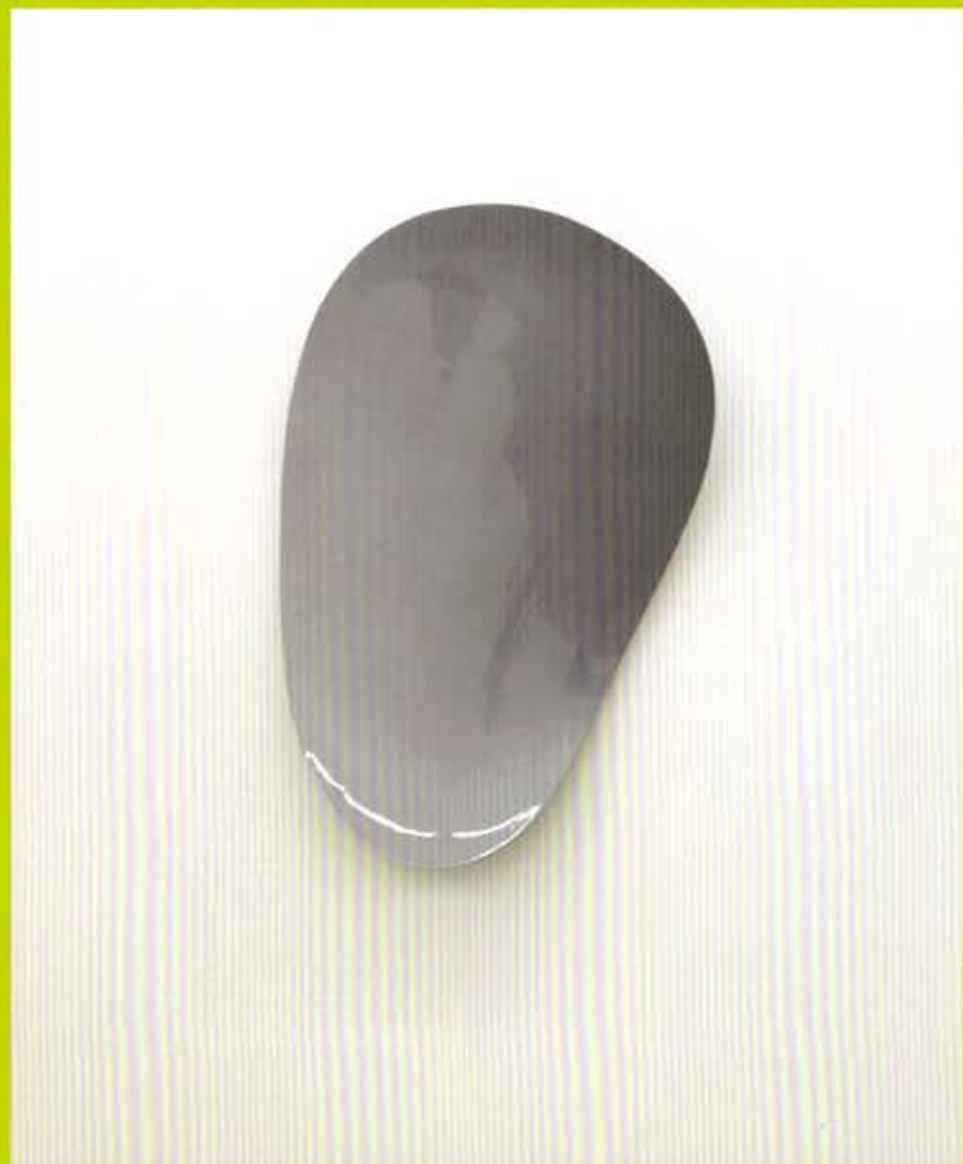
image above: John MEADE: Carolla Component (Gray) , 2012, fibreglass, powder coated steel, 2 pack automotive paint, 155 x 95 x 40cm, Courtesy of the artist and Sutton Gallery.

8 March - 11 May 2014 Curator: Dianne Mangan