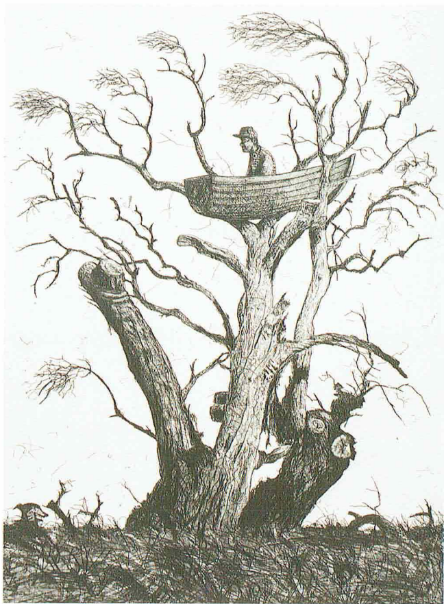
Catalogue No 22