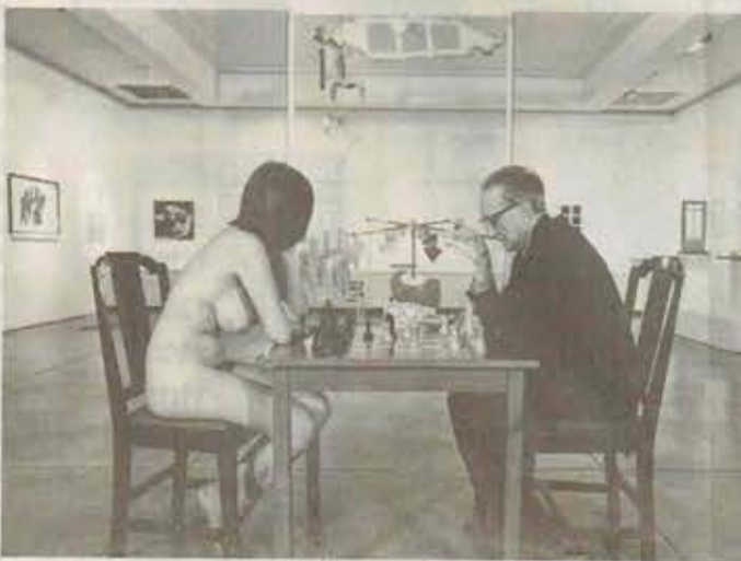
Julian Wasser's Marcel Duchamp Playing Chess with a Nude