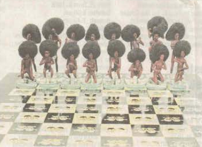
Untitled (2003) by Jake and Dinos Chapman